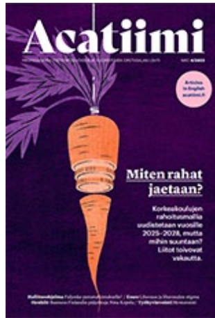
Acatiimi magazine covers 1/2023 and 4/2023

Opinions about current issues concerning universities and research institutes were expressed in the Professors' Blog. The topics of the articles included the Government Programme, university funding, university language practices and freedom of research.