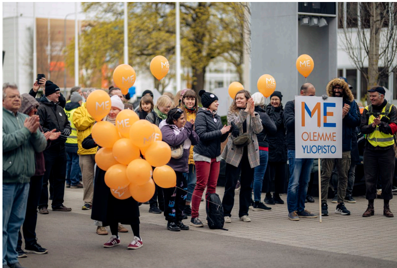
Strike at Tampere University on 7 May 2025.

We prepared for the upcoming round of negotiations within the industrial action committee for the university sector and other JUKO unions. We campaigned together with other JUKO unions on the significance and content of the General Collective Agreement. The content of the Yliopistotes.fi website is available in Finnish, English and Swedish.