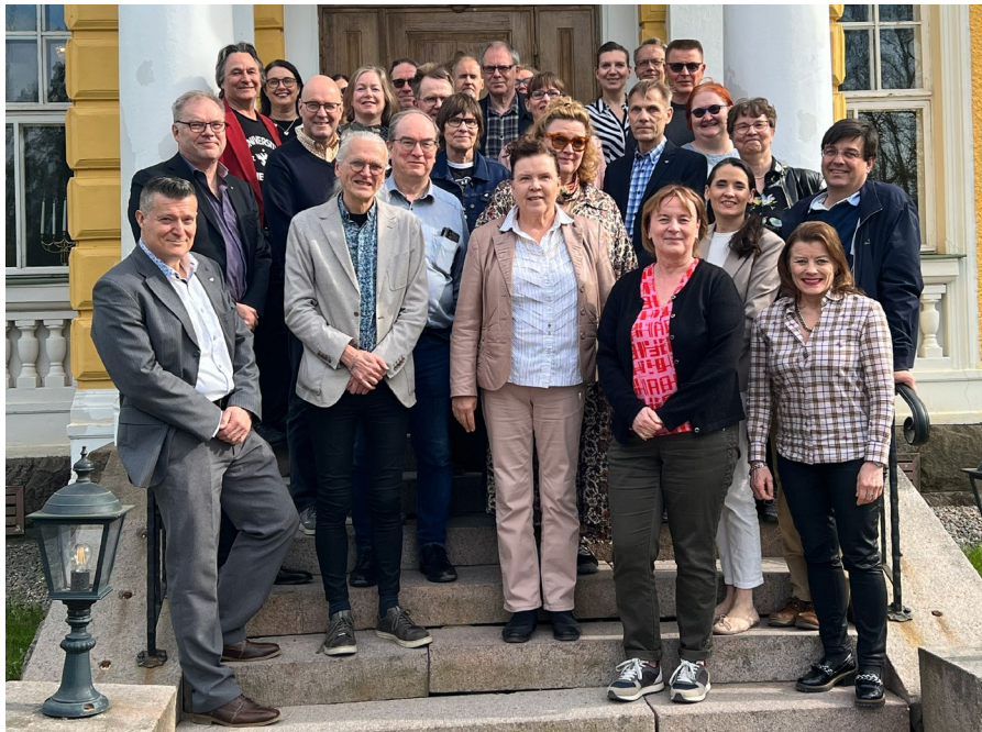
Active representatives of the Union's local activities participated in the development seminar on local activities held in Hirvihaara, Mäntsälä on 21 May 2025.

PROFESSORILIITTO PROFESSORFÖRBUNDET FINNISH UNION OF UNIVERSITY PROFESSORS