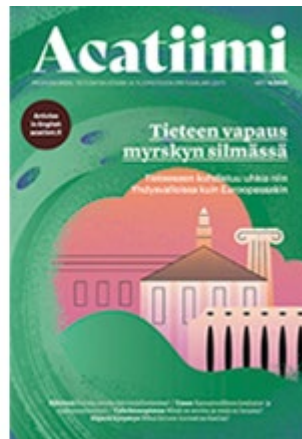
Acatiimi magazine covers 1/2025 and 4/2025

We updated the membership benefits we offer. Our members received, for example, the Tiede and Acatiimi magazines. The Finnish Union of University Professors publishes the Acatiimi magazine together with the Union of Research Professionals and the Union for University Teachers and Researchers in Finland (YLL). Five issues of the magazine were published during the year. The magazine has its own website at acatiimi.fi .